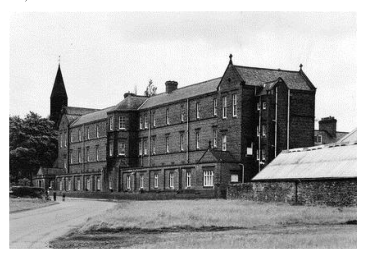
Figure 5. St. Mary's Home, which was built on the Tudhoe Academy site around 1900.

Book for 1900 listed "Tudhoe Orphanage (B.C.). 5s. a week. Very Rev. Canon Watson". The 1911 census listed 213 people in the St Mary's Home for Roman Catholic Girls. It remained a home for girls until 1939 and for boys after that. It closed in about 1965 and was demolished a few years later. The houses of St. Mary's Close now stand on the site.