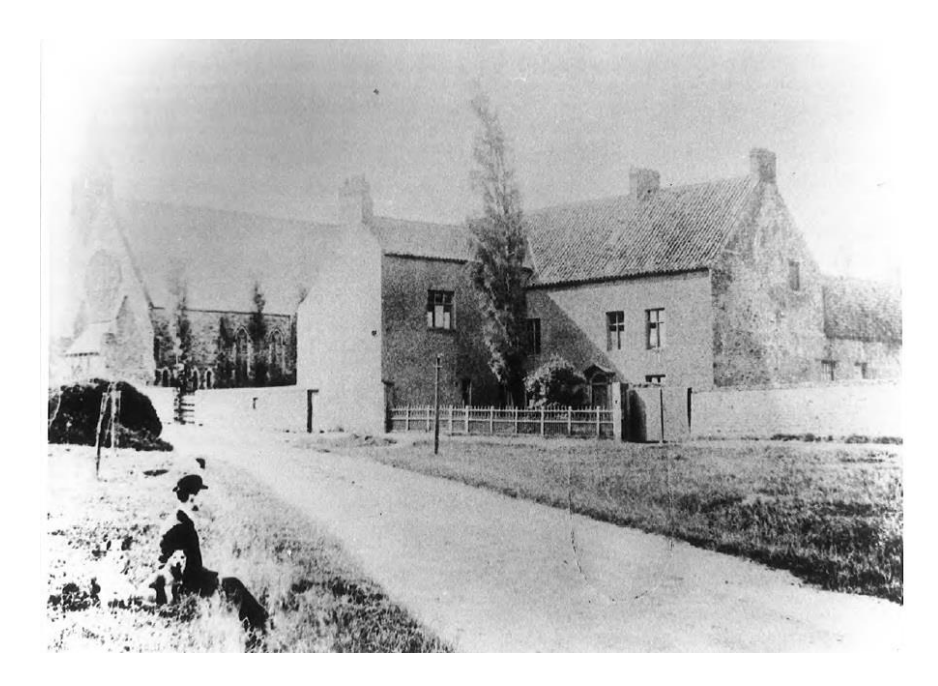
Figure 1. The Tudhoe Academy building, with St. Charles's church in the background.

The English Catholic College at Douai was overrun by the French Revolution in October 1792. Some of its students had left for England by then, but the remainder were imprisoned in Doullens. They were released to return to England only in March 1795, but a few escaped from prison. Some of the initial refugees were housed at Old Hall Green, but by January 1794 it had reached capacity. When 11 new escapees arrived in London at the end of January, the five of them who were from the north were sent by William Gibson, Bishop of the Northern District of the Catholic Church, to be lodged with Mr. Storey at Tudhoe. They arrived in March 1794 and were joined in the summer by John Lingard, who had left Douai before them, as their principal. Lingard went on to become an important Catholic historian. The Douai group stayed until September 1794, when they moved on, briefly to Pontop Hall and then to a temporary College that was established in Crook Hall. It was to be another 14 years before more permanent accommodation was found for them.