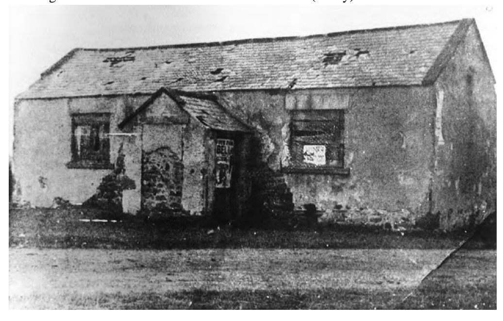
Figure 6. The Tudhoe School building, shortly before demolition around 1913.

The Education Act of 1870 provided for the establishment of school boards in underprovided areas, and from 1876 government-funded schools were built in the areas of Tudhoe Grange and Tudhoe Colliery (A.M. Lilley, PhD thesis, Durham University, 1982). Before that, however, there was a day school in the village itself, known as Tudhoe School and located across the village green from the old Academy; the building was demolished in 1913 or soon afterwards (Lilley).